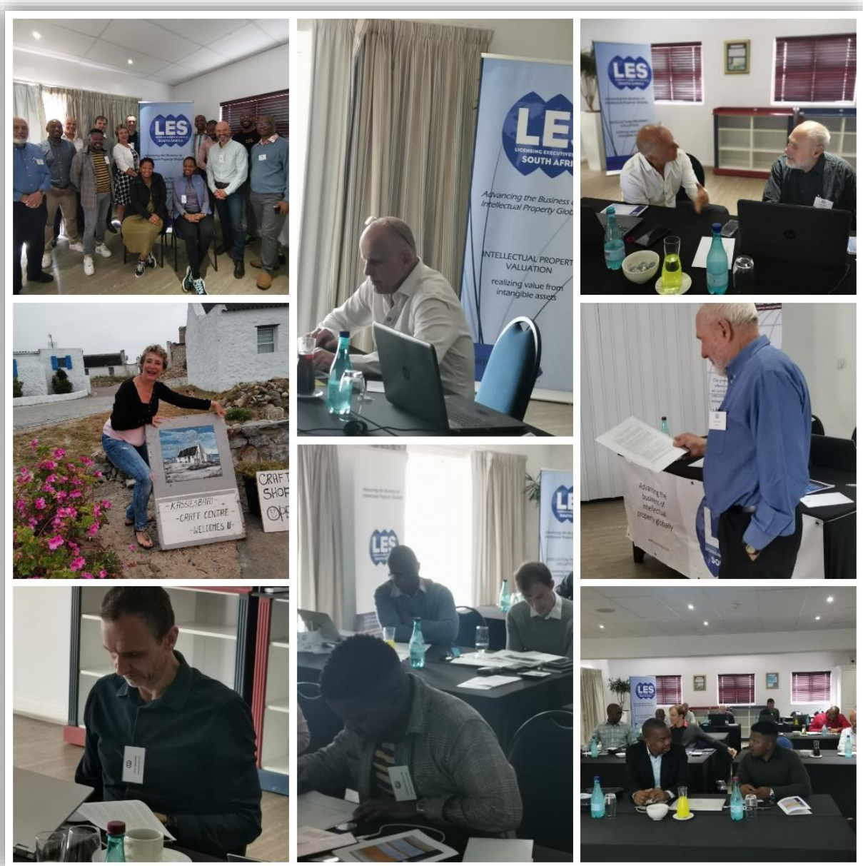
Figure 1 In training with delegates